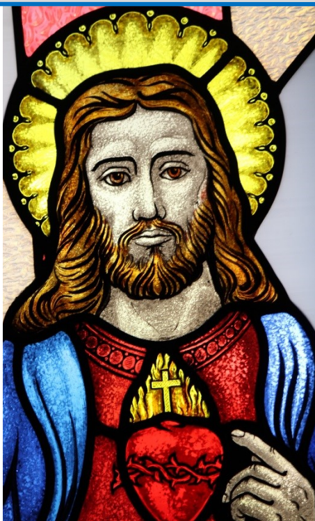
Photo Insert: Stained glass window of the Sacred Heart of Jesus, located inside the St. Maria Goretti chapel within St. Anthony's church at Edwardstown, South Australia.

Email: edcathpar@adam.com.au Website: www.edwardstown.catholic.net Facebook Page: StAnthonyofPaduaRomanCatholicChurch